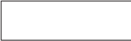
Bright White 001

Actual finish colors may vary slightly. Exact color chips are available upon request.