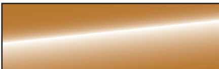
Copper Penny 006