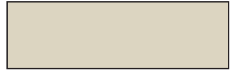
Light Stone 003